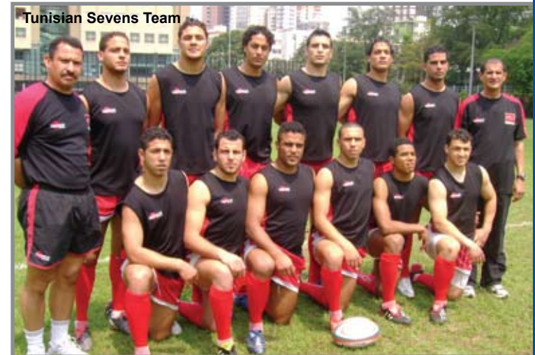
Tunisian Sevens Team