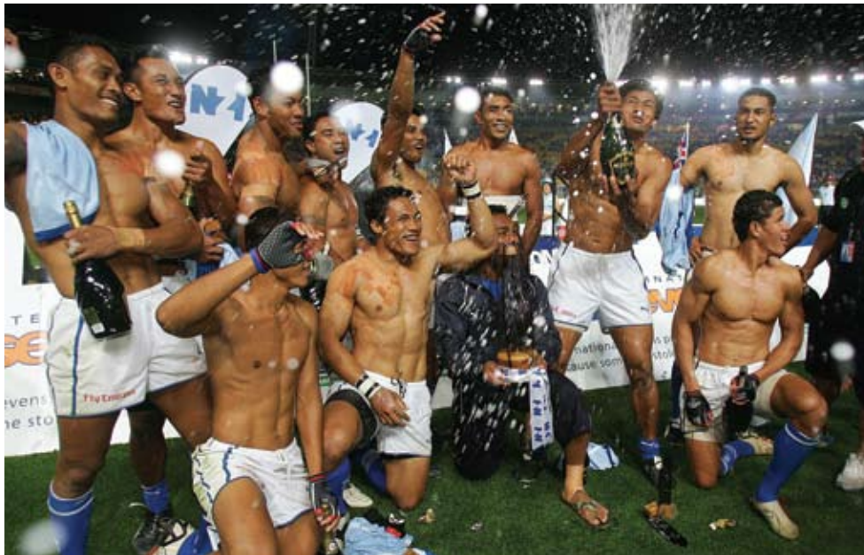
Samoa Sevens wearing Progrip Gloves