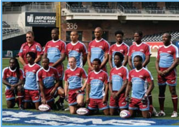
West Indies International Sevens Team